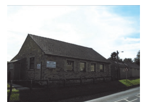
Swinton Reading Room And Community Hall