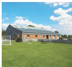
BSA Sports Centre