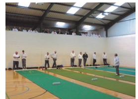
Pairs in Progress